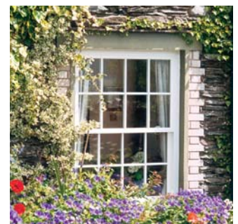
1 Renolit foil finishes